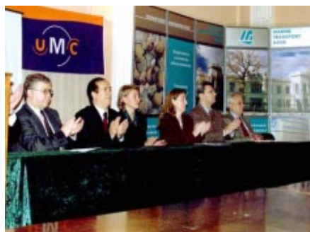
Honourable guests of the Model United Nations give warm welcome to the participants at the Assembly Hall of Odesa National Economic University.

Model United Nations conference is a simulation of the work of the United Nations Organization. This is a role-playing game, during which participants assume the roles of the envoys of different countries to the United Nations.