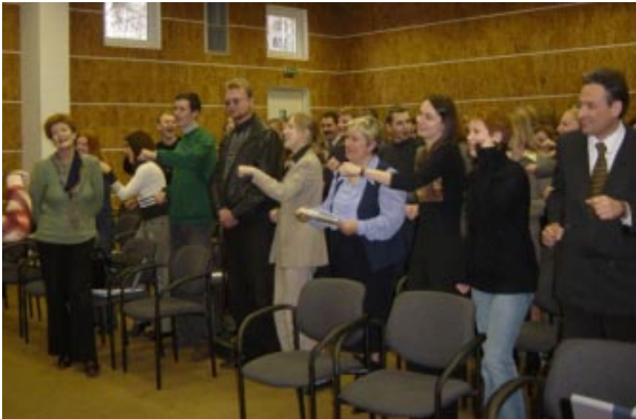
Participants perform a crazy dance «Funky Chicken», a part of presentation of the national youth NGO «Youth CAN».

The All-Ukrainian Volunteer and NGO Fair was a follow-up activity on Legal Status of Volunteers and NGO activity. The original Youth Volunteer Fair was held during the week of 30th June - 5th July 2003 in the European Youth Centre Budapest, Budapest, Hungary. Kateryna Nalyvayko and Yuliya Kobets both attended the Fair and represented American Councils for International