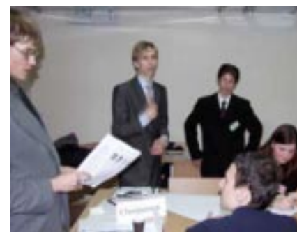
A heated discussion in the unmoderated caucus takes place in the Security Council.

The second half of the day was dedicated to the two introductory sessions which covered basic information about the UN, Model UN and the UN session procedure. Then all the participants had a dinner at «Till